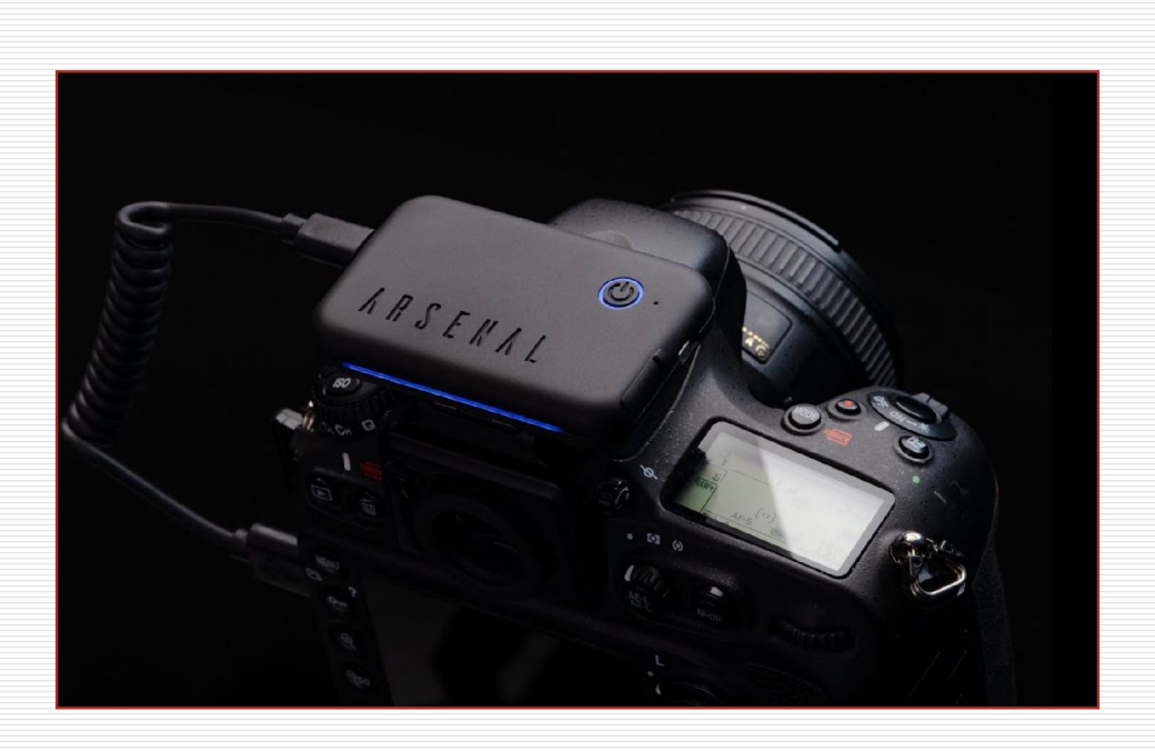
View video at https://youtube.com/watch?v=PNj8yBI14YQ